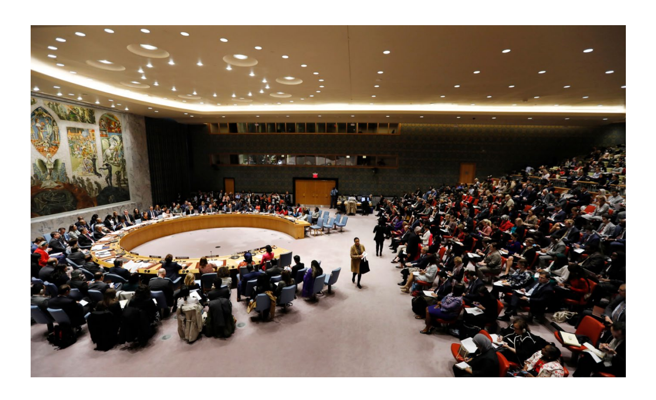
Women, Peace and Security: Security Council Open Debate United Nations, New York, 29 October 2019