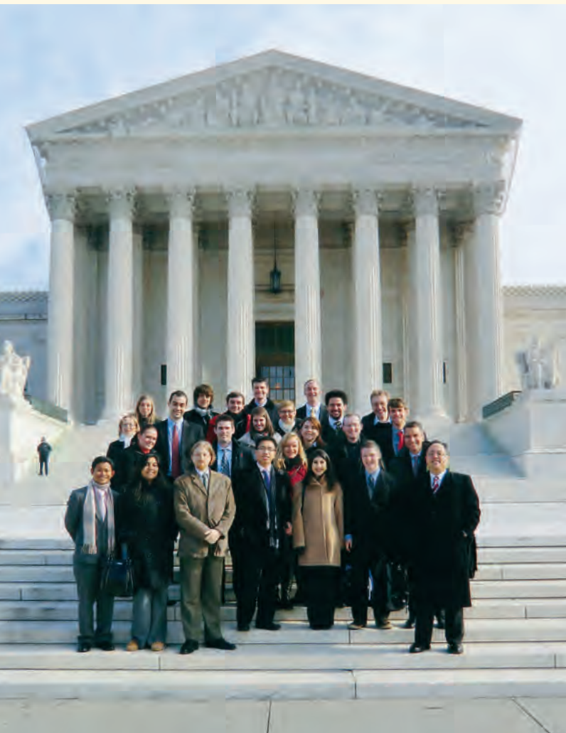
GRS students and faculty outside the United States Supreme Court in Washington, DC