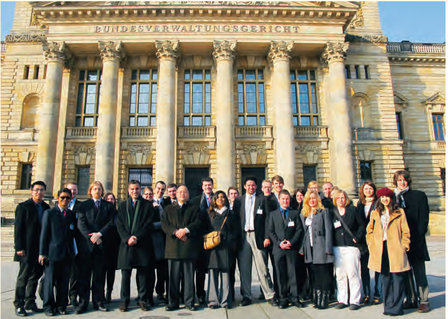
Opposite: GRS students and faculty at the Federal Communications Commission in Washington, DC