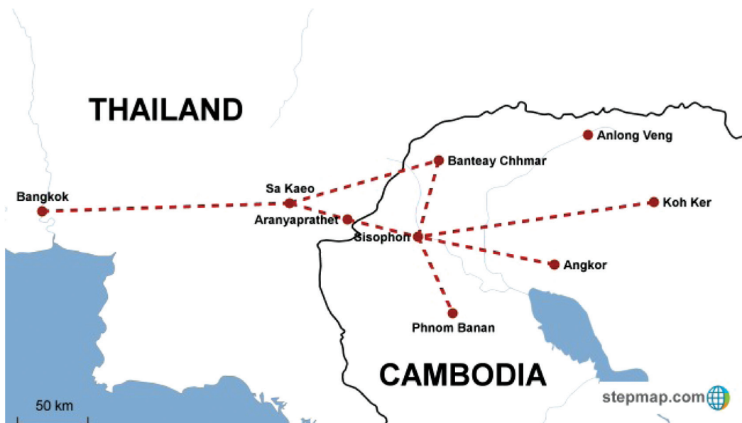
FIG. 2 Trafficking routes in the ‘Channel 1’ network.