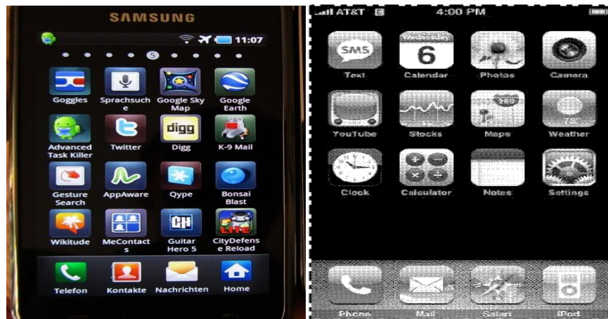
Figure 1: Samsung TouchWiz (left) compared with D604,305 (right)

An example may be helpful. Consider Design Patent No. D604,305, 105 owned by Apple, Inc., pictured below. The patent claims a screen for an electronic device with icons presented on it. The icons are square with rounded corners, and they are tiled four across. The patent includes a row of four icons at the bottom of the screen. In the actual device, we know that these bottom icons — presumably those most favored by the user — remain the same, no matter what screen one looks at. Of course, the patent does not require that the icons stay the same from screen to screen. It only requires the icons to be on a gray background at the bottom. Samsung developed a competing interface for its smartphones. Apple sued Samsung, and a jury found that Samsung’s user interface (commonly called “Touch Wiz”) infringed this design patent. 106